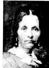
Eliza Roxcy Snow