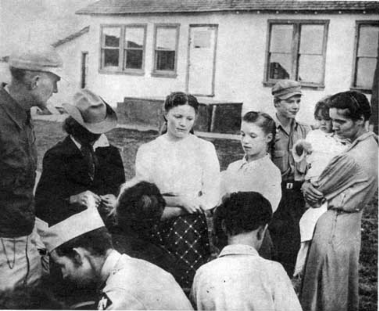
Part of the polygamy cult, including two white-bloused girls who State claims were forced into marriage, at Short Creek after raid.