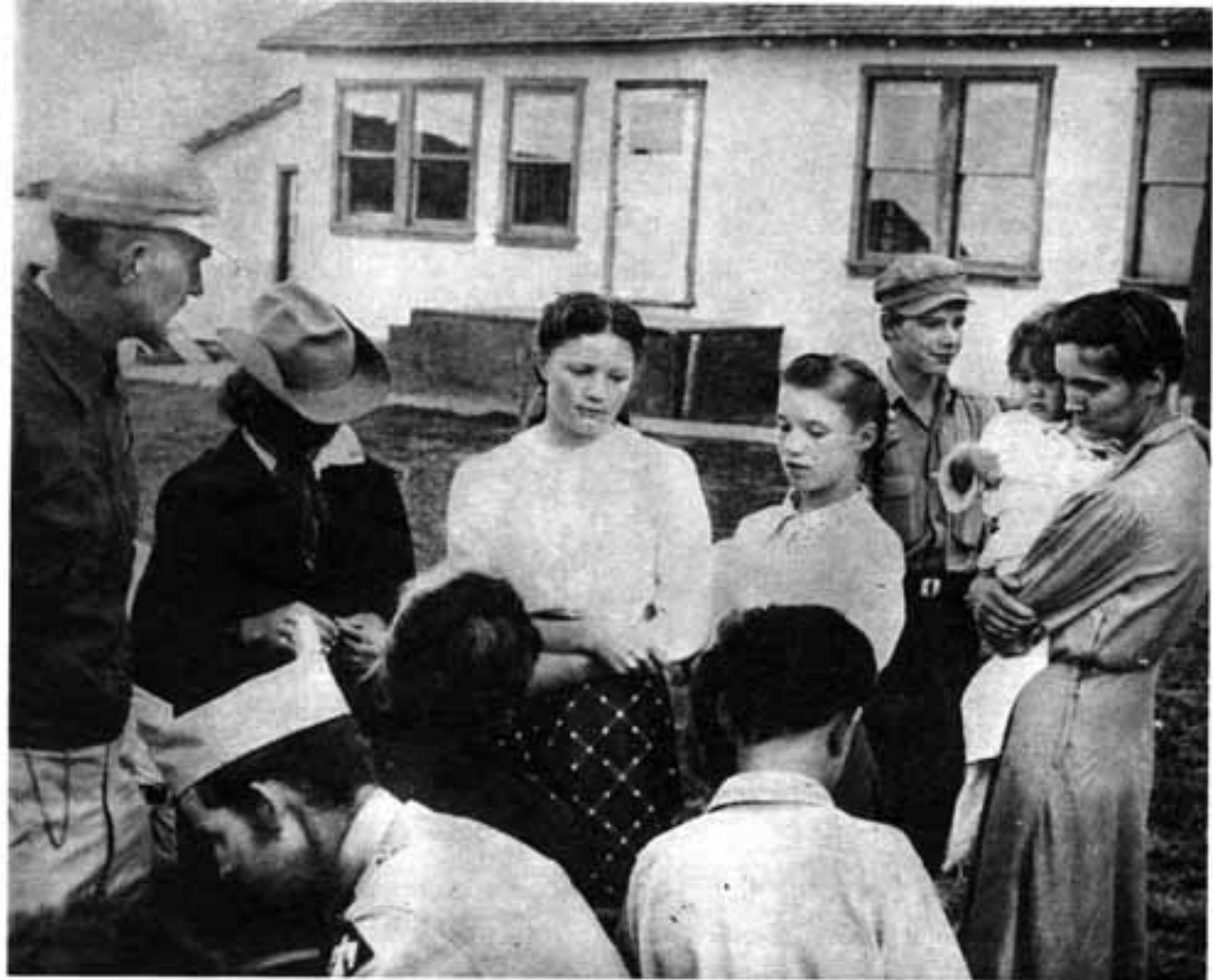
Part of the polygamy cult, including two white-bloused girls who State claims were forced into marriage, at Short Creek after raid.