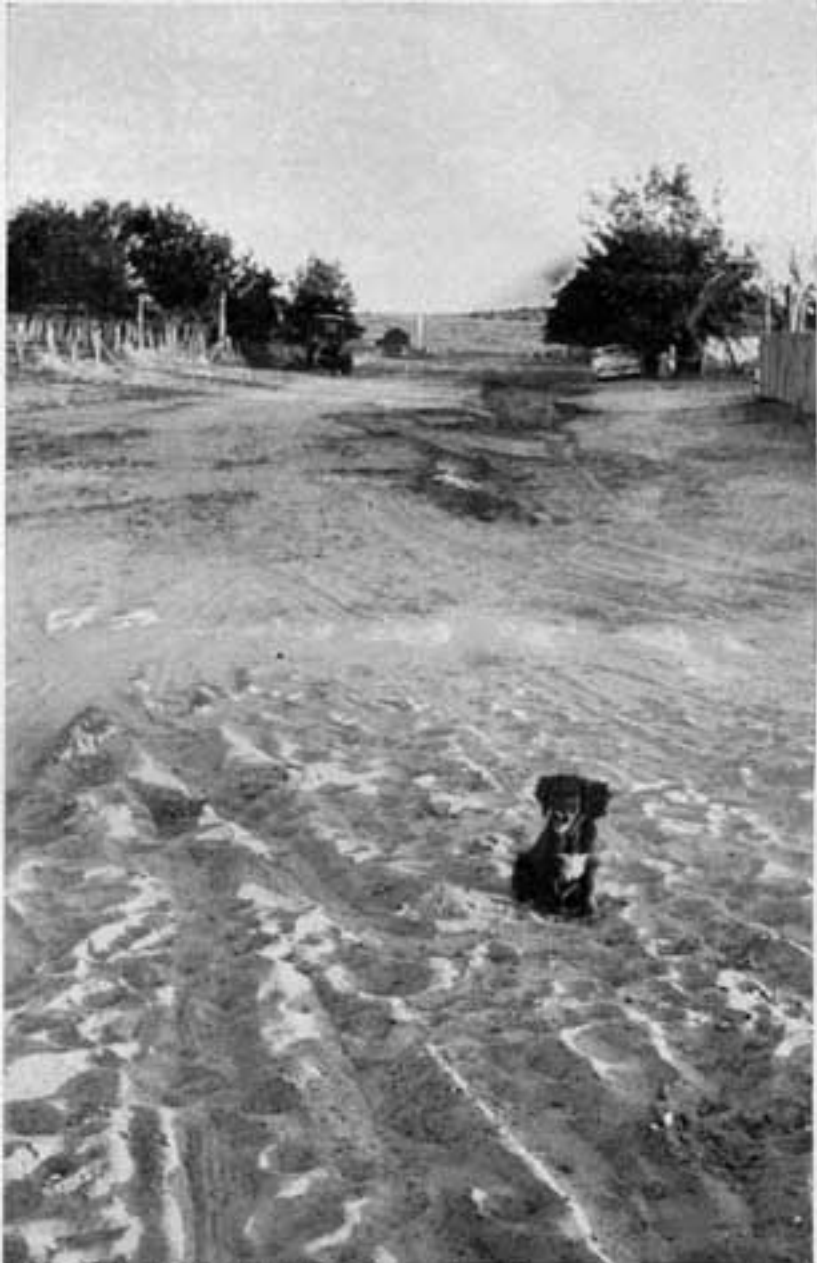
DESERTED PUPPY , left behind in town when his young master was taken by the state troopers to Phoenix, sits in the deserted main street of Short Creek.