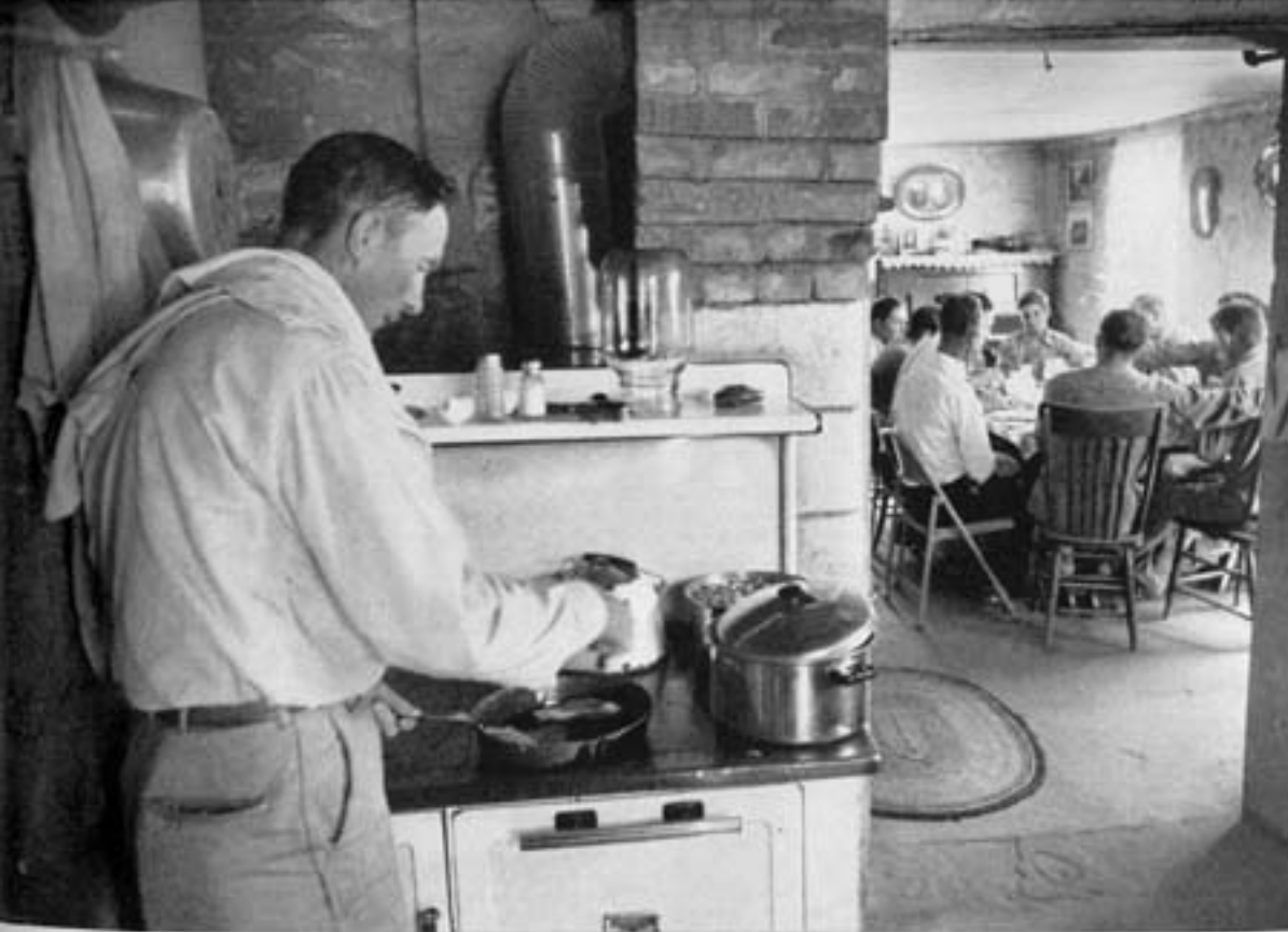
THEIR WIVES IN STATE'S CUSTODY, "FUNDAMENTALISTS" OF SHORT CREEK, ARIZ. LIVE IN AN ALL-MALE ATMOSPHERE. HERE THEY EAT THEIR BREAKFAST