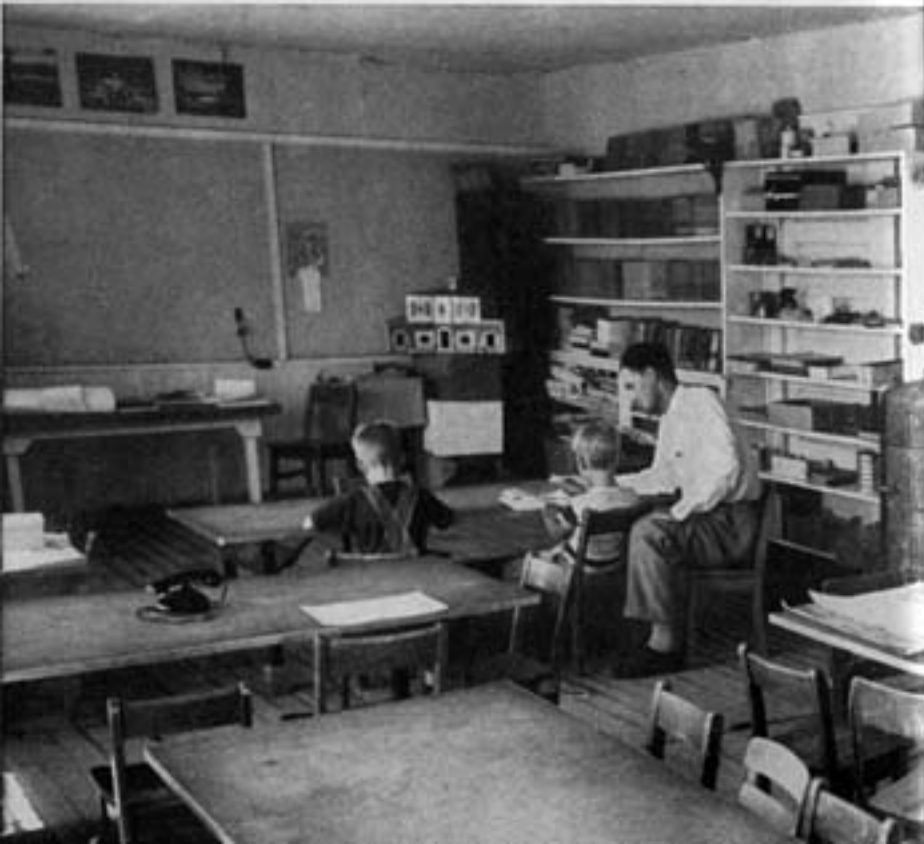
ONLY TWO CHILDREN LEFT IN SHORT CREEK GET LESSONS FROM PRINCIPAL.