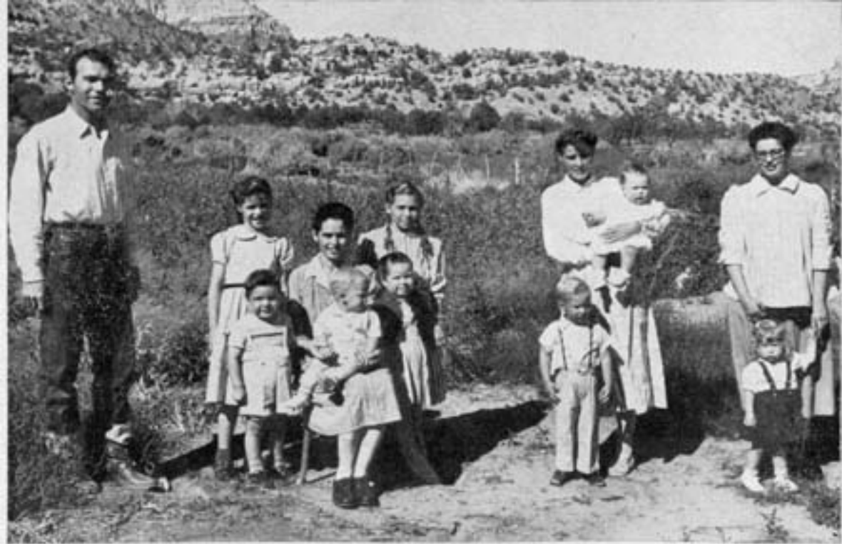
MACKERT HOUSE includes three women and eight children. Two women say they came from polygamous families and "have never known what monogamy is."